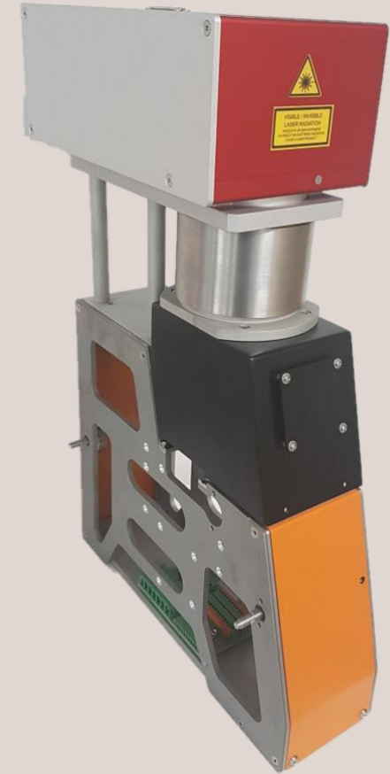
Laser module with a MPIX laser