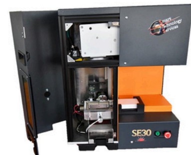
Input hopper up to 120 cards