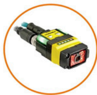
Vision inspection registration